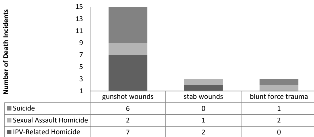
Cause of Death (Number of incidents = 21)

Five death incidents (24%) took place in a public location, including two cases at a motel, one in a roadway, and two cases outdoors near residential areas. The remaining cases occurred at a personal residence, with half of residential based incidents occurring at a residence shared by the IPV victim and perpetrator. Two death incidents took place at a residence in which only the decedent lived. Six incidents occurred at the residence of a friend or relative of one of the parties. One IPV-related death incident was witnessed by a minor child. The figure below shows the distribution of location for cases reviewed by type of death incident.