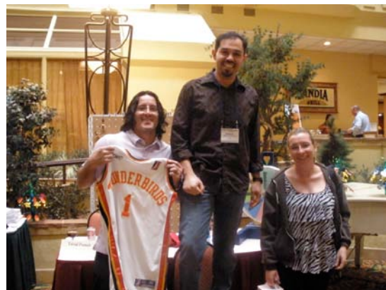
Attendees enjoying their Trivial Pursuit Trivia Game winnings