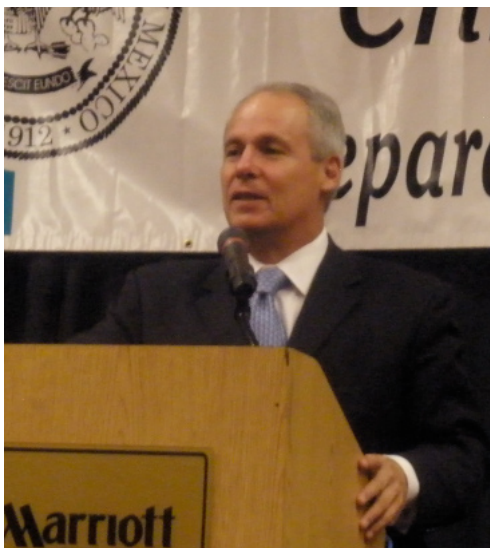
Mayor of Albuquerque, Martin Chavez, discusses the Family Advocacy Center in Albuquerque and the pet adoptions